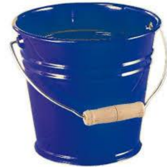
Enterprise (benefits City&County)